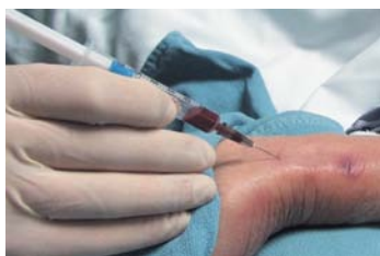
Figure 3. Puncture of the Radial Artery.

The radial artery is located between the tendon and the styloid process.